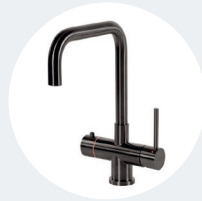
Vitoria Gun Metal