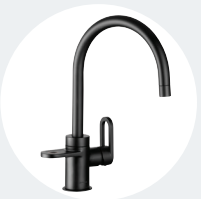
Alessio Matt Black