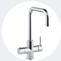
Vitoria Polished Chrome