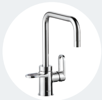
Adrianna Polished Chrome