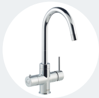
Calisto Polished Chrome