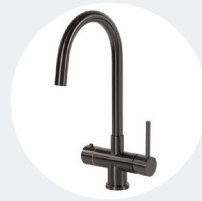
Calisto Gun Metal