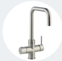
Vitoria Stainless Steel Effect