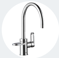
Alessio Polished Chrome