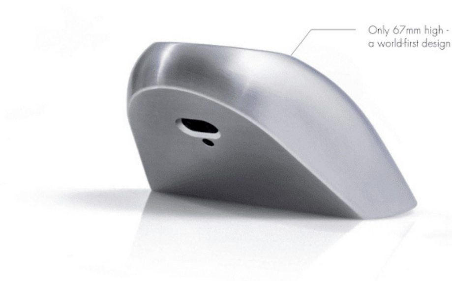
Only 67mm high - a world-first design