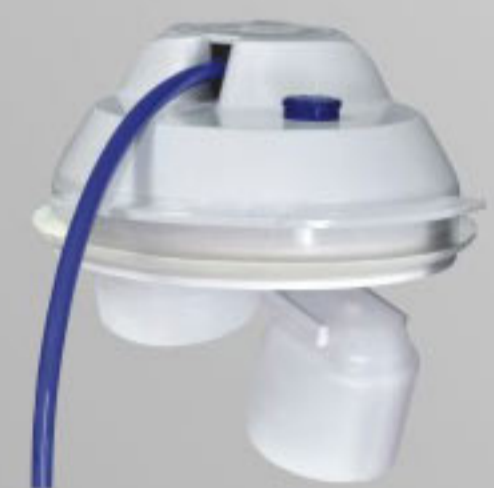
Point of Use Kit