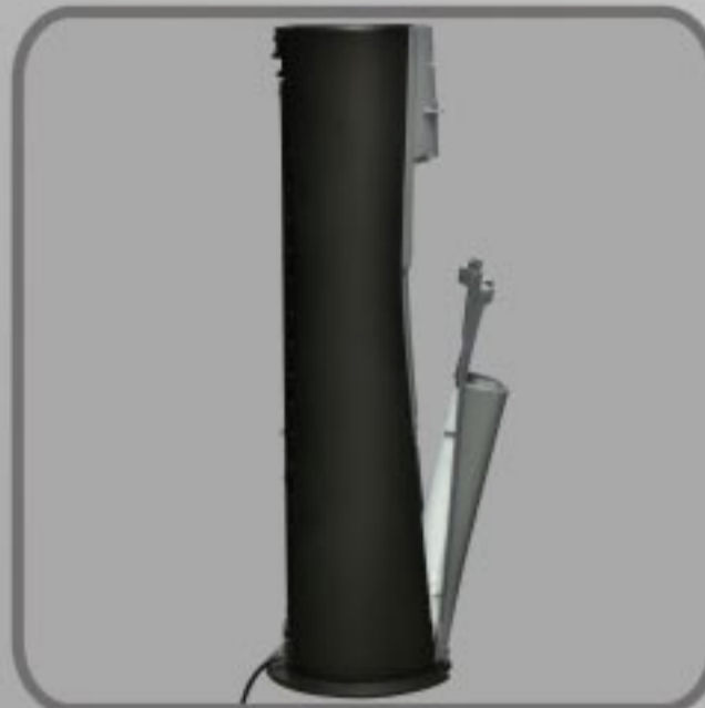
Replaceable Lower Front Panel with Optional Integrated Cup Dispenser