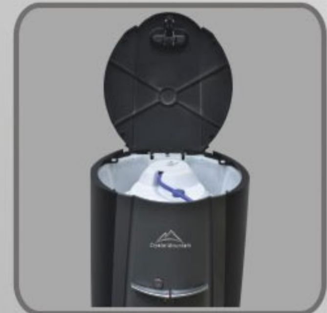
Retrofitted to Become a Point of Use Dispenser