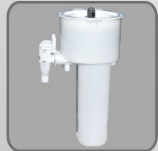
Removable Reservoir/Faucet Assembly (patent pending)