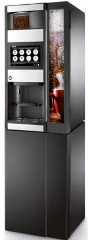
The elegant base stand enhances the design of the machine.