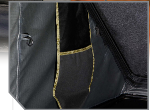
BUILT-IN LARGE STORAGE POUCHES

The Mamba III is the best in class all Aluminum-Bodied Hard Side Roof Top Tent with more standard included options. The Mamba III has a Set Up and Put Away time of less than a minute. The Mamba III Roof Top Tent has a clean, rugged, durable, sleek and an aerodynamic design compared to traditional Roof Top Tents. The Mamba III Roof Top Tent comes with 2 standard cross bars to help carry extra gear for your adventure. The cross bars are not expandable, but they have the ability to be removed if need be.