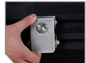
HEAVY-DUTY MARINE GRADE STAINLESS STEEL LATCH