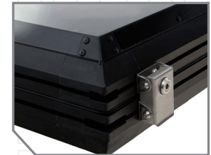
LOW PROFILE DESIGN ONLY 8 INCHES TALL