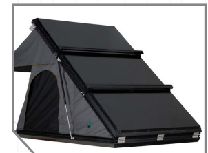
REMOVABLE CROSS BARS TO MOUNT ACCESSORIES