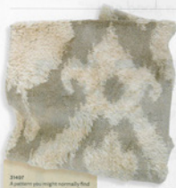
21457 A pattern you might normally find in an oat, reinterpreted as a fuzzy shag. Wool blend in Color M. knoell.com