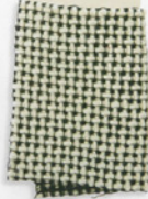
MORRIS WOOL Graphic and textured, this bold design will add a bit of cheer to your room. Wool blend in Tusk. maharam.com