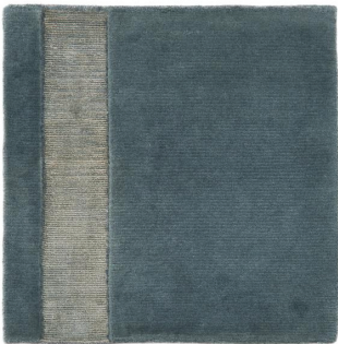
1-3368 INDIAN TEAL