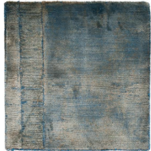
1-1629 SNORKEL BLUE