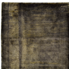
1-5022 OLIVE MUSK