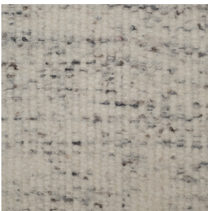
2-4933 SNOW CAP