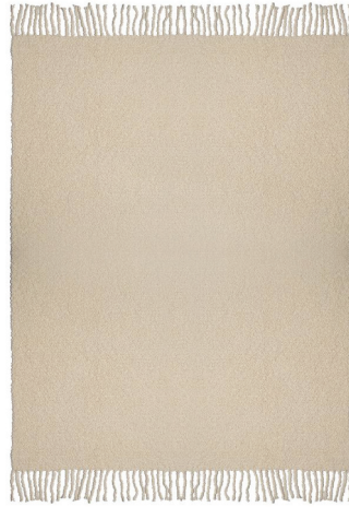
3-4594 WHITE P U R A UNDYED