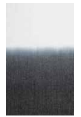
2-5239 DEEP INDIGO

Rosemary Hallgarten Inc. Headquarters 163 Main Street Norwalk, CT 06851 203-259-1003 samples@rosemaryhallgarten.com