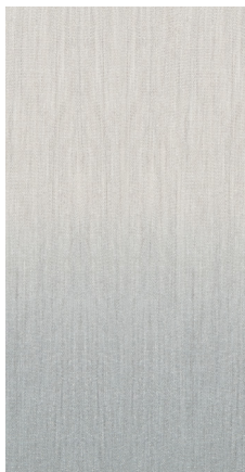
2-7408 SUMMER'S DAY