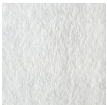
2-6584 APRES SKI