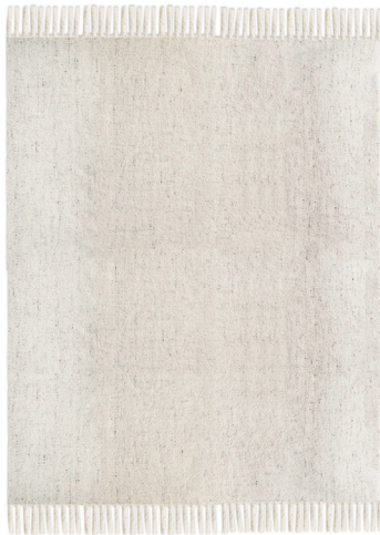
3-5248 SNOW CAP