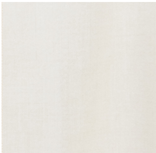
3-8018 CREAM PURA UNDYED