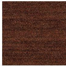
2-8785 TIGER'S EYE