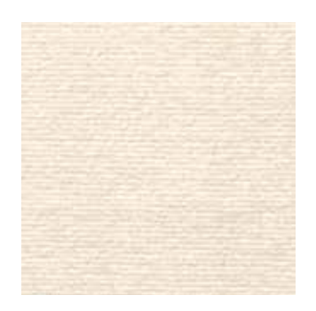
2-7122 SAND DOLLAR