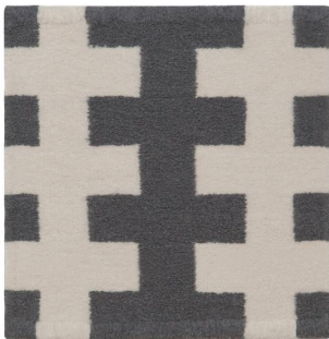
1-4786 GREY AQUA & WHITE ALPACA, POLYAMIDE