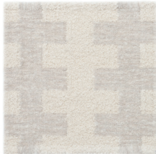
1-5776 MACADAMIA ALPACA & PEBBLE BOUCLE