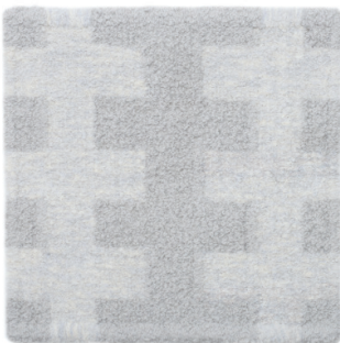
1-5777 SEASTONE ALPACA & PEBBLE BOUCLE