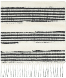
1-7658 BLACK & WHITE