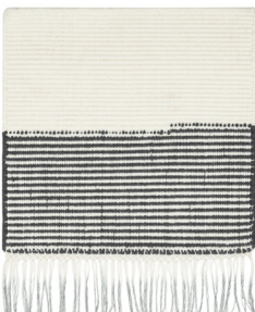
1-7657 BLACK & WHITE