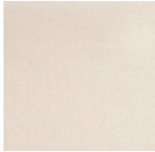
2-2427 SAND P U R A UNDYED