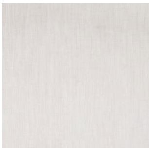
2-3403 SILVER BIRCH