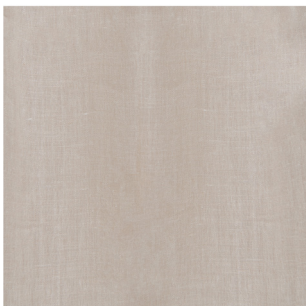
2-8159 WHITE OAK