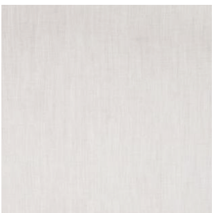
2-3403 SILVER BIRCH