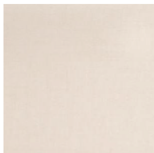
2-2427 SAND PURA UNDYED