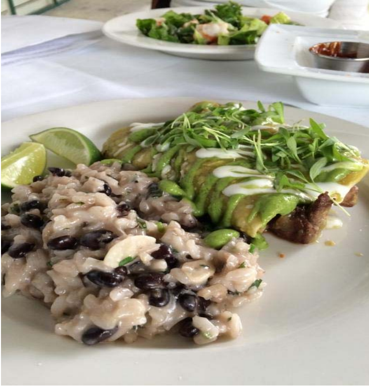
The Wine Cask's filet mignon enchiladas have the perfect sidekick in the black bean risotto