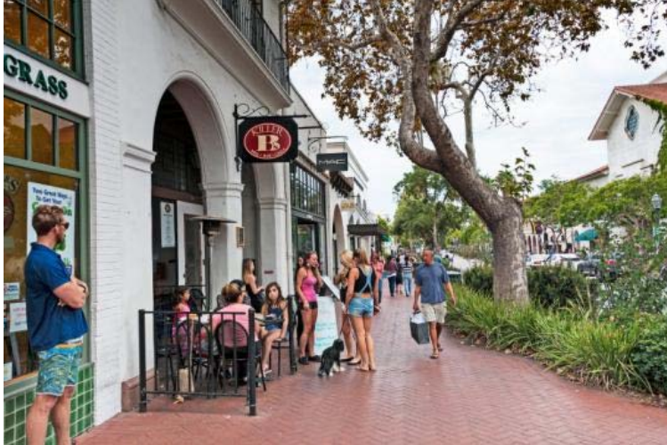
The window shopper/people watchers' paradise: State Street

The center of downtown Santa Barbara has tons of cute shops, bars and restaurants. While it boasts its fair share of chain clothing stores (Abercrombie & Fitch, Old Navy, etc.) there are also some cool boutiques. Plum Goods touts itself as “a little shop with a big heart,” and features a wide variety of funky trinkets — including art, textiles, glassware toys, and cards. Another must-visit shop on State: Punch Interieurs, which has a ridiculously hip collection of vintage furniture, clothing, and gifts. State Street is the perfect place for a fun and lazy afternoon of window shopping, eating and casual imbibing.