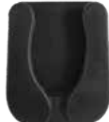
Wall Mount Holder