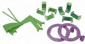
Uni-Verse-All Positioning Kit