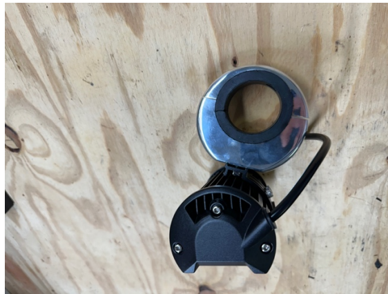
Rubber installation for 2.0" Diameter tubing.

6. Install the other half of the clamp and tighten it in place.