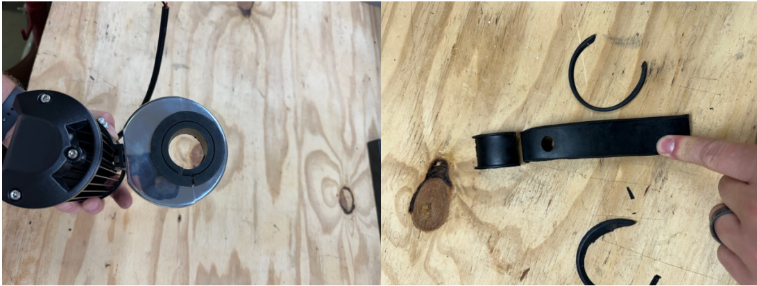
Rubber installation for 1.5" Diameter tubing.