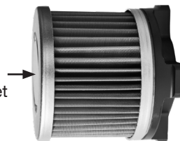
Figure 2. Rare-earth magnet