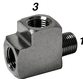
Street-tee pipe fitting

NOTE: It may be necessary to test fit the front half of the oil filter adapter to the motorcycle to determine the proper "clocking" orientation of the 1/8" female pipe port to ensure clearance of any obstruction.