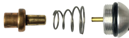
Alternative "always on" installation

This reversal of the spring will allow the spring to force the actuator into the by-pass hole all the time, meaning oil will always be sent to the oil cooler.