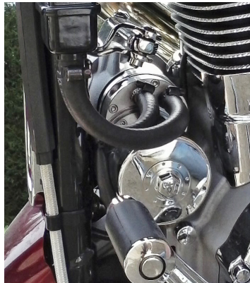
This mounting orientation may be required on some Sportster models