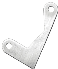
4600AR-C Jagg anti-rotation device