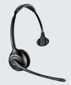
CS510 Over-the-head (monaural)

Plantronics legendary CS family is setting a wireless standard for desk phone communication with the CS500 Series. The system features the lightest DECT headset on the market, a streamlined design and professional performance all with the same reliability for hands-free productivity that has made the CS family a bestseller for over a decade.