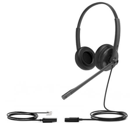
YHS34/YHS34 Lite Dual