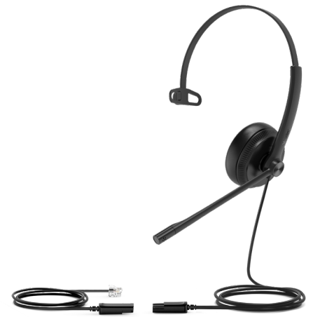
YHS34/YHS34 Lite Mono

Built for comfort with soft ear cushions and ultra-lightweight materials, the YHS34/YHS34 Lite is 10%~30% lighter than other headsets in the same range. Its ergonomic design makes this headset comfortable enough for long conference calls and all day use.