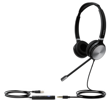
UH36 Dual Teams UH36 Dual UC