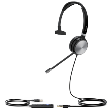
UH36 Mono Teams UH36 Mono UC

Deeply integrated with Yealink IP phones that the advanced features, such as volume synchronization and multiple calls control, are just right at your fingertips.