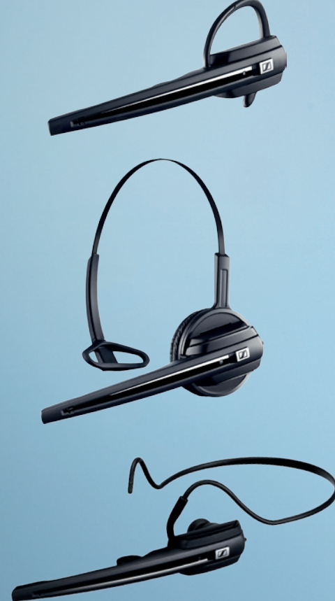
Note: Neckband available as accessory