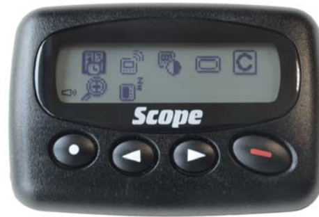
Icon driven for simple operation

Single AAA battery. Alkaline or NiMH re-chargeable