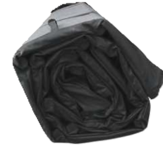
Commercial Foam Inside