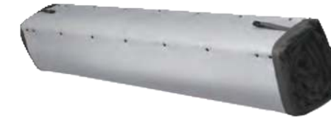
PVC Cloth Underside