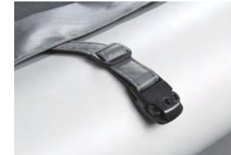
Straps With Buckles