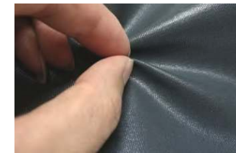
Top Grade Anti-tear Cloth