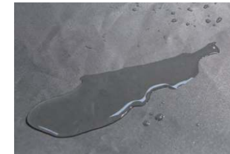
100% Waterproof Material