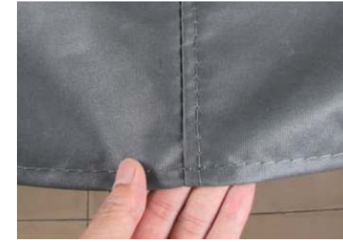
Oxford Cloth Surface