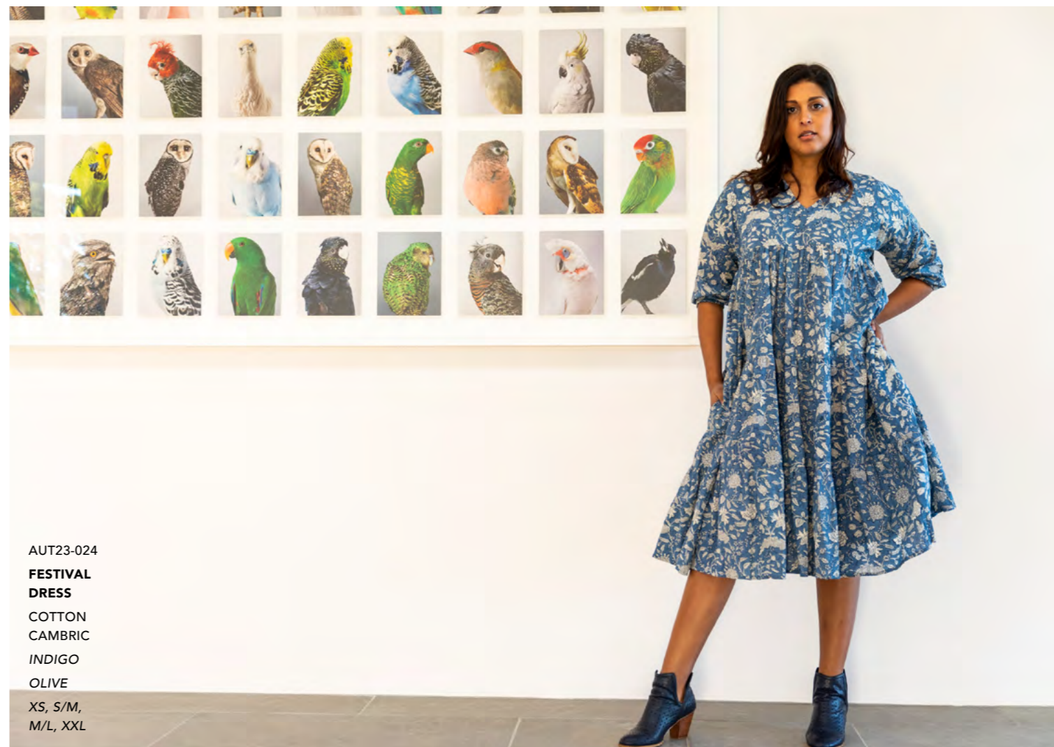
AUT23-024 FESTIVAL DRESS COTTON CAMBRIC INDIGO OLIVE XS, S/M, M/L, XXL