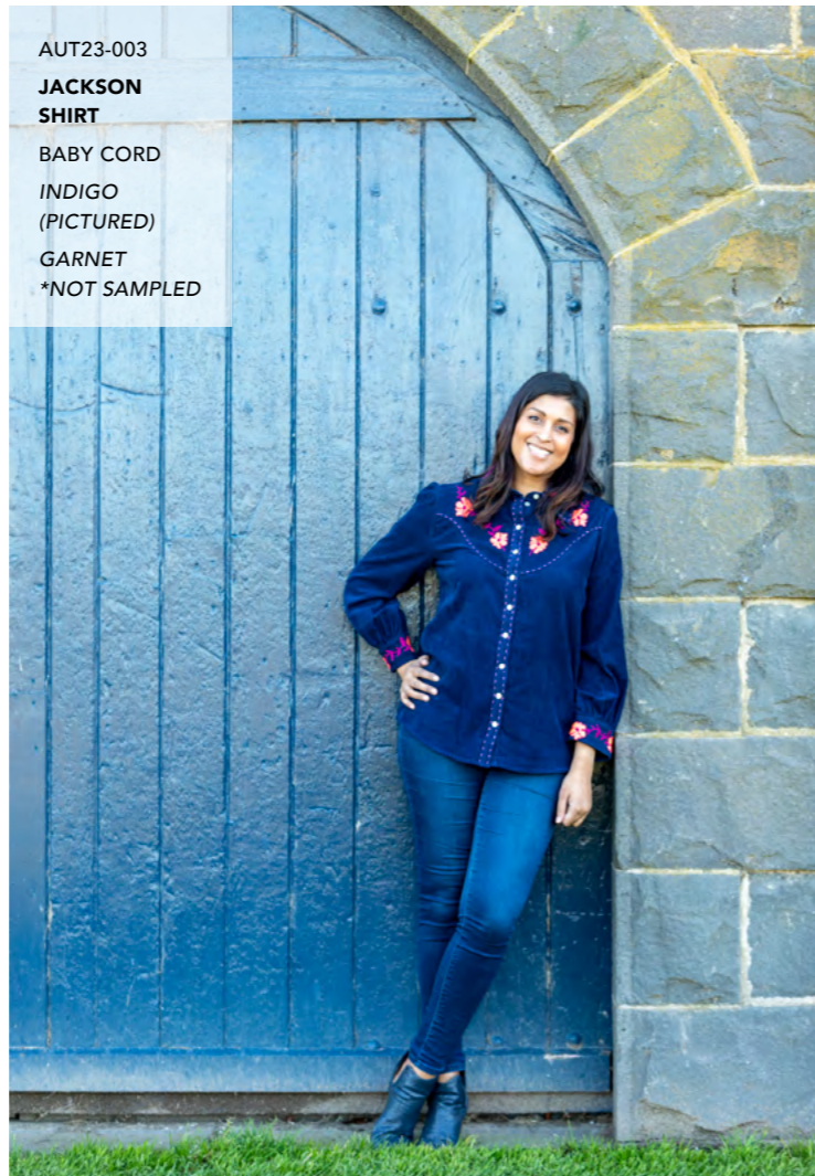
AUT23-003 JACKSON SHIRT BABY CORD INDIGO (PICTURED) GARNET *NOT SAMPLED