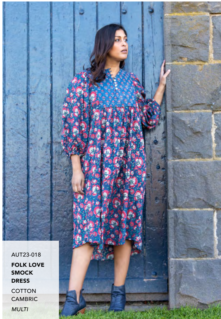
AUT23-018 FOLK LOVE SMOCK DRESS COTTON CAMBRIC MULTI