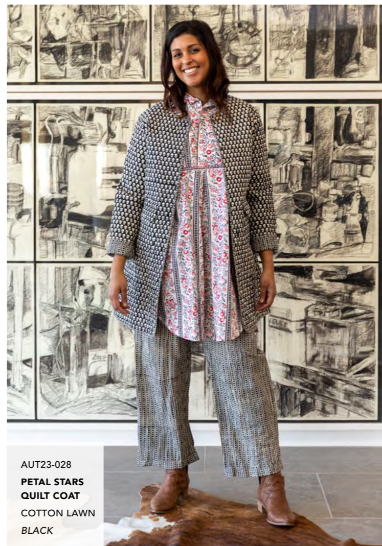
AUT23-028 PETAL STARS QUILT COAT COTTON LAWN BLACK