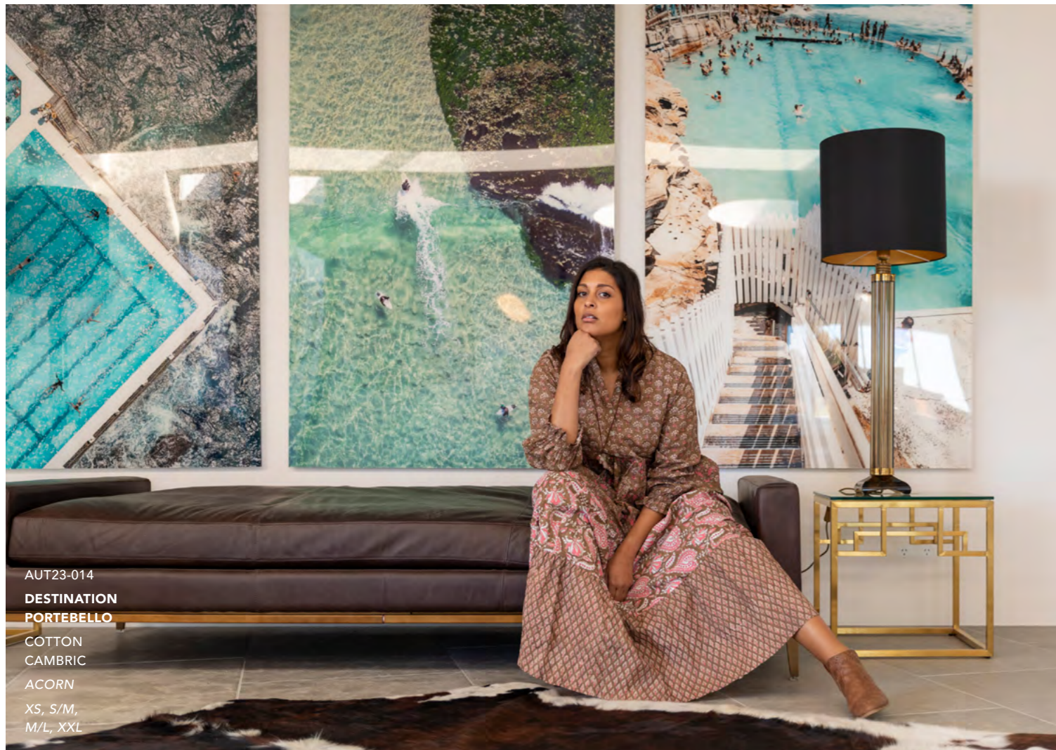
AUT23-014 DESTINATION PORTEBELLO COTTON CAMBRIC ACORN XS, S/M, M/L, XXL