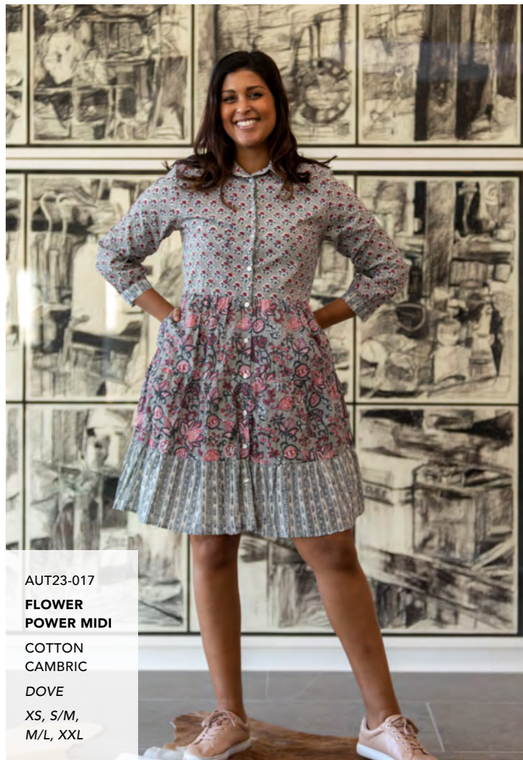
AUT23-017 FLOWER POWER MIDI COTTON CAMBRIC DOVE XS, S/M, M/L, XXL