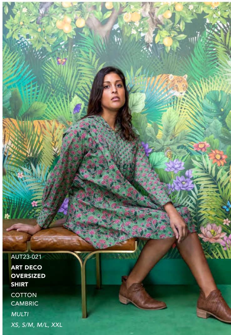
AUT23-021 ART DECO OVERSIZED SHIRT COTTON CAMBRIC MULTI XS, S/M, M/L, XXL