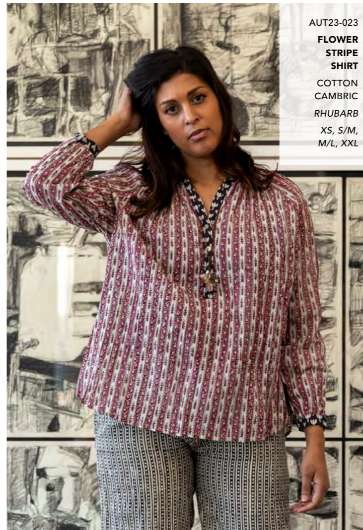
AUT23-023 FLOWER STRIPE SHIRT COTTON CAMBRIC RHUBARB XS, S/M, M/L, XXL