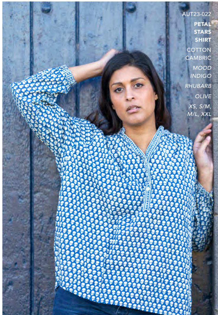
AUT23-022 PETAL STARS SHIRT COTTON CAMBRIC MOOD INDIGO RHUBARB OLIVE XS, S/M, M/L, XXL