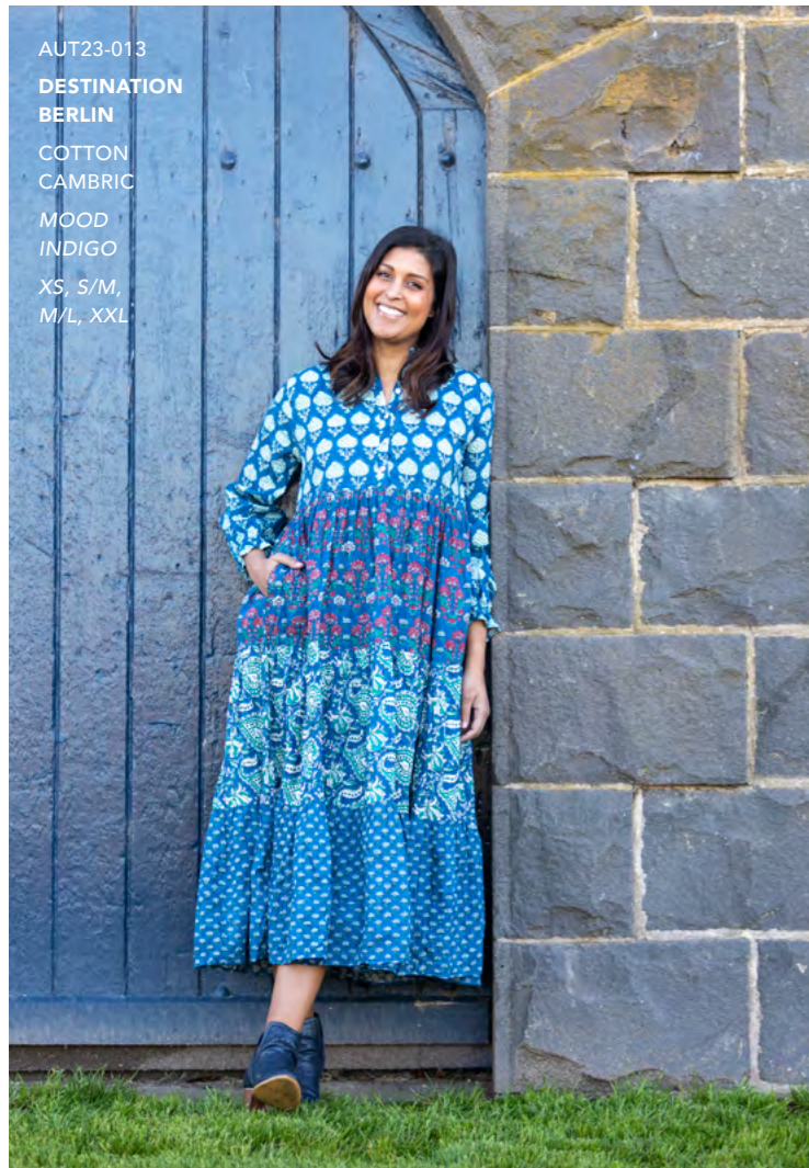
AUT23-013 DESTINATION BERLIN COTTON CAMBRIC MOOD INDIGO XS, S/M, M/L, XXL