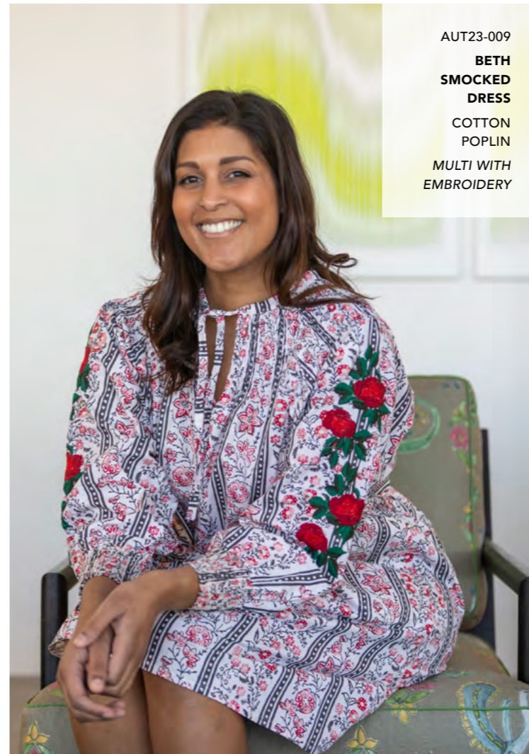
AUT23-009 BETH SMOCKED DRESS COTTON POPLIN MULTI WITH EMBROIDERY