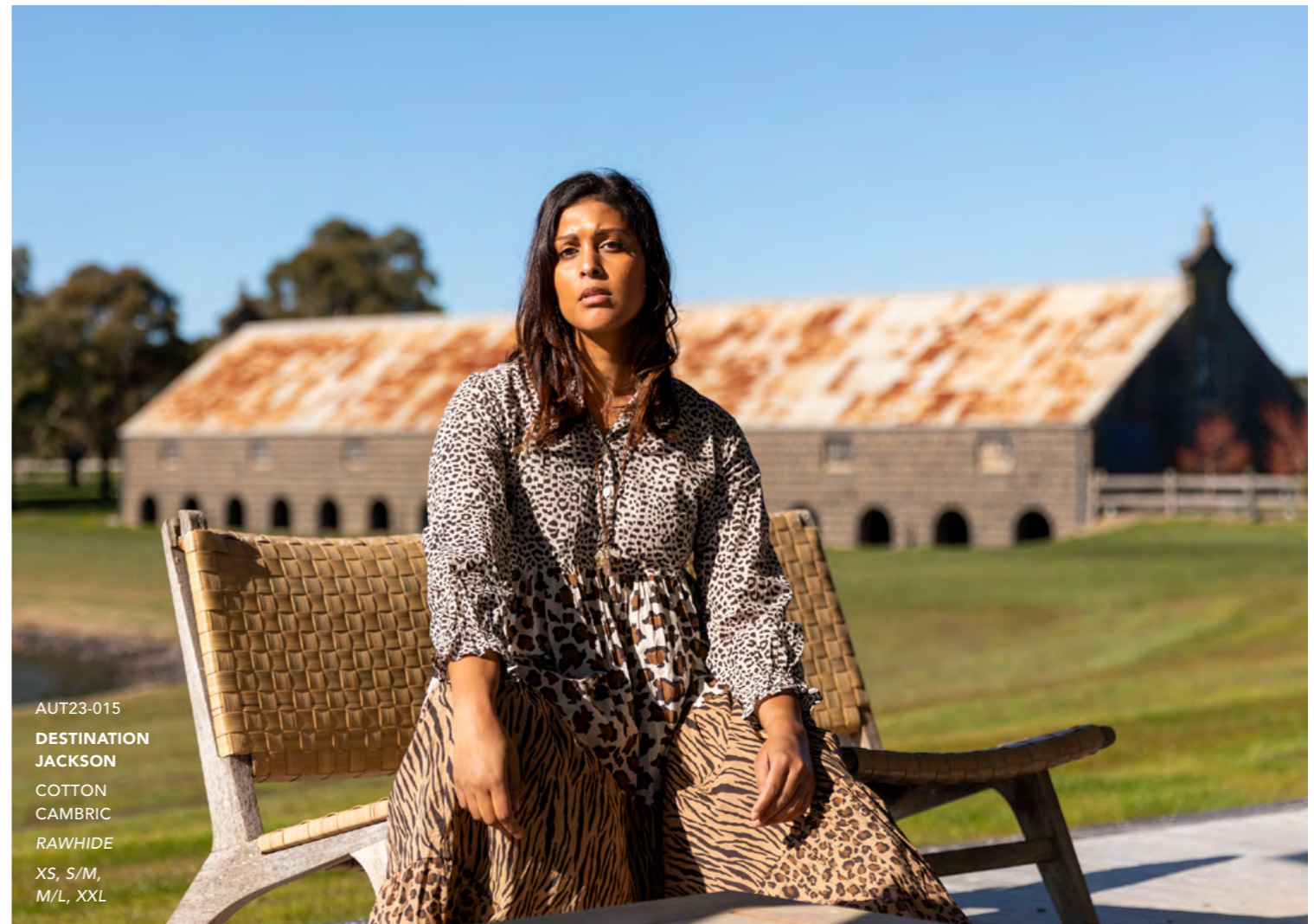
AUT23-015 DESTINATION JACKSON COTTON CAMBRIC RAWHIDE XS, S/M, M/L, XXL