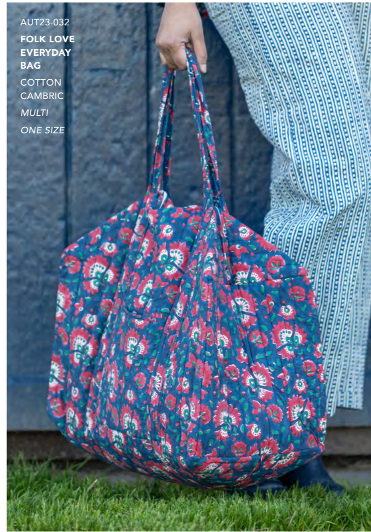
AUT23-032 FOLK LOVE EVERYDAY BAG COTTON CAMBRIC MULTI ONE SIZE