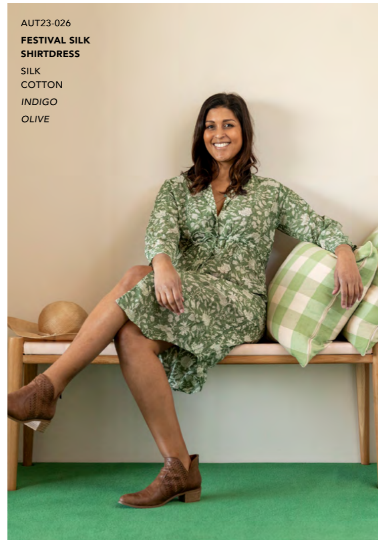
AUT23-026 FESTIVAL SILK SHIRTDRESS SILK COTTON INDIGO OLIVE