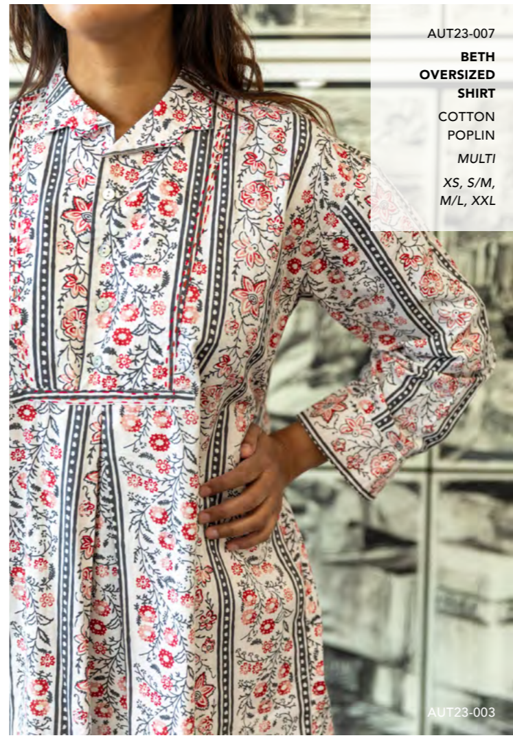
AUT23-007 BETH OVERSIZED SHIRT COTTON POPLIN MULTI XS, S/M, M/L, XXL