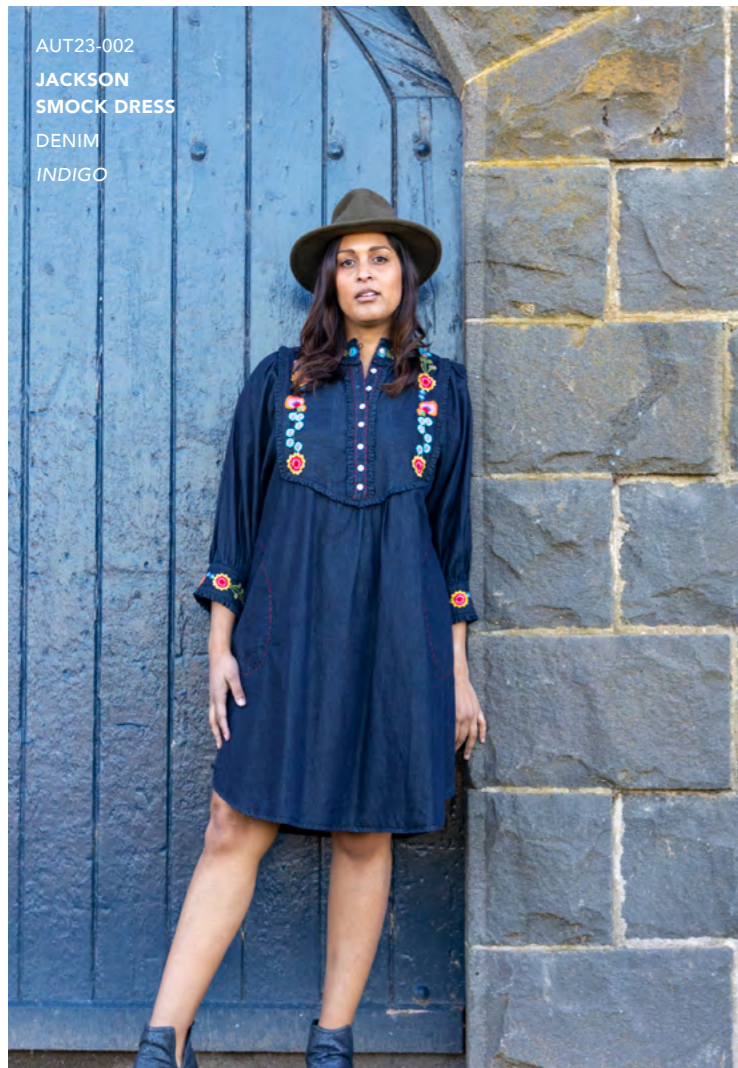
AUT23-002 JACKSON SMOCK DRESS DENIM INDIGO