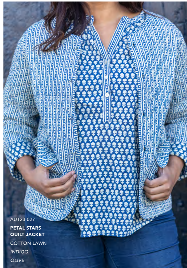
AUT23-027 PETAL STARS QUILT JACKET COTTON LAWN INDIGO OLIVE