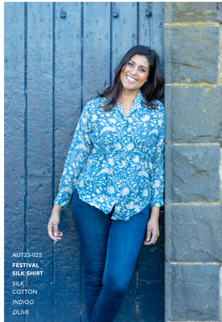
AUT23-025 FESTIVAL SILK SHIRT SILK COTTON INDIGO OLIVE