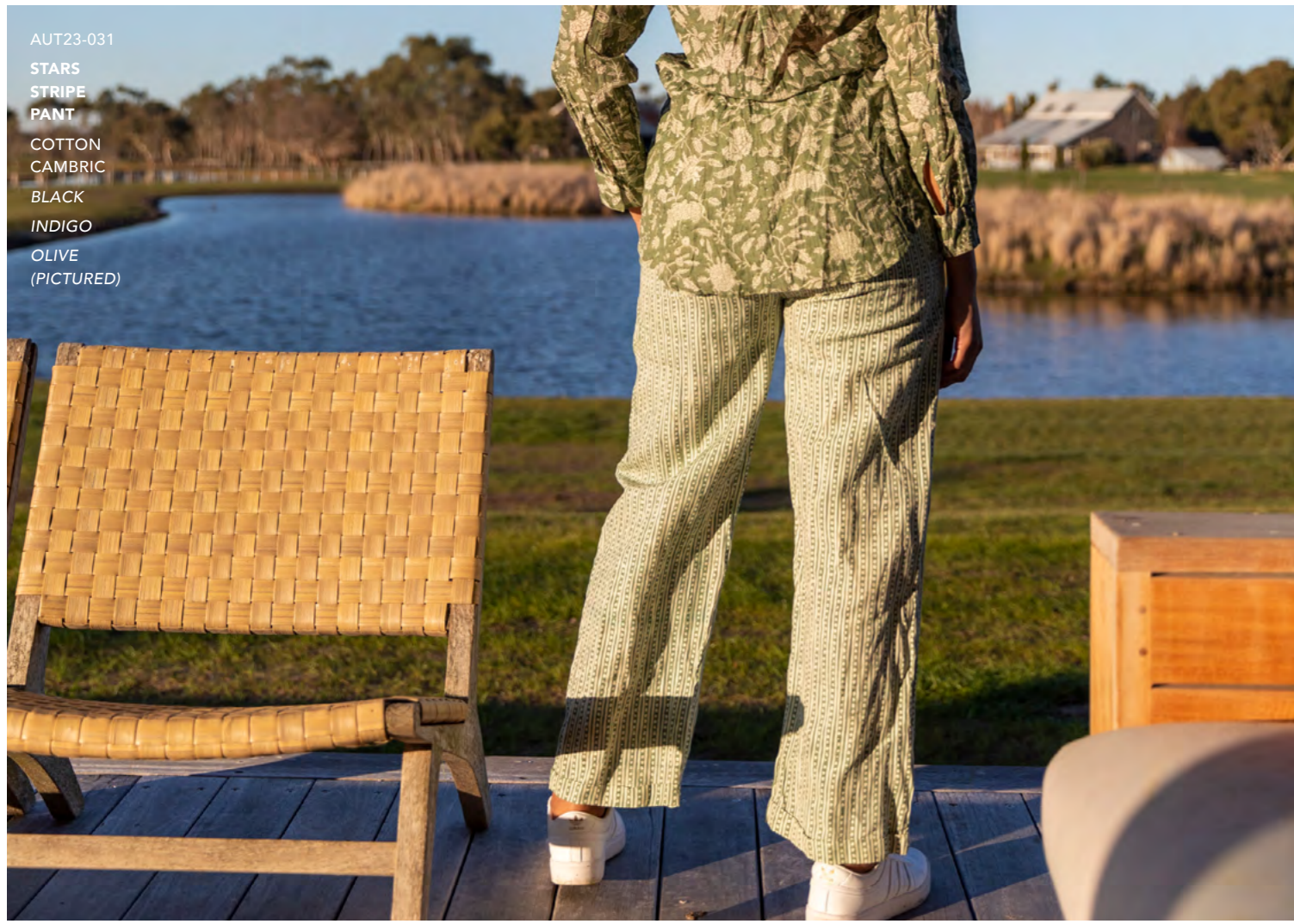
AUT23-031 STARS STRIPE PANT COTTON CAMBRIC BLACK INDIGO OLIVE (PICTURED)