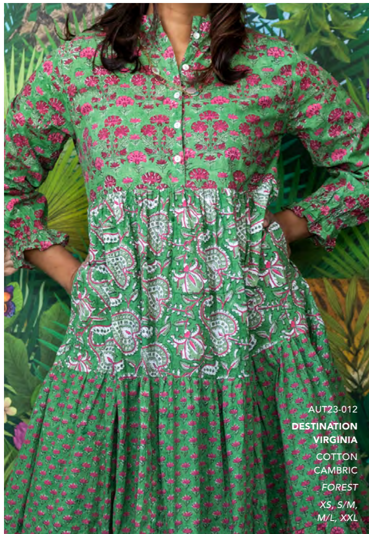
AUT23-012 DESTINATION VIRGINIA COTTON CAMBRIC FOREST XS, S/M, M/L, XXL