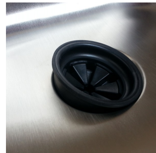
Insert splash guard