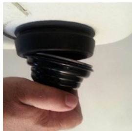
Insert drain lip