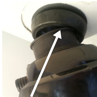
Put lip into mounting seal*