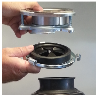
Remove mounting hardware