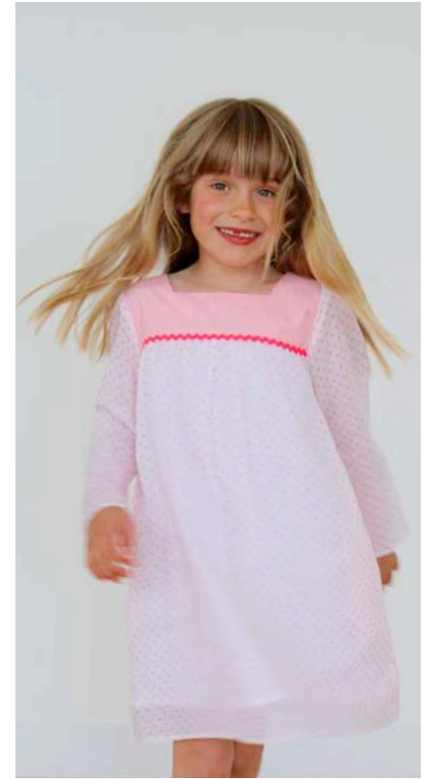
Lillie Dress Cotton Stars and Stripes - White / Pink