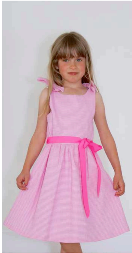
Isabella Dress Cotton Candy Stripe - Pink