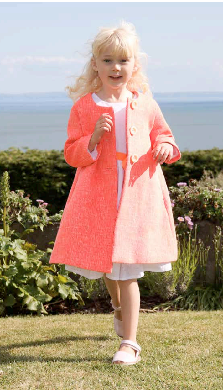
This Page: Monroe Coat Luxury Italian Woven Cotton - Orange Opposite Page: Jackie Jacket Luxury Italian Woven Cotton - White / Orange Charlotte Dress Cotton Honeycombe - White / Neon Trim