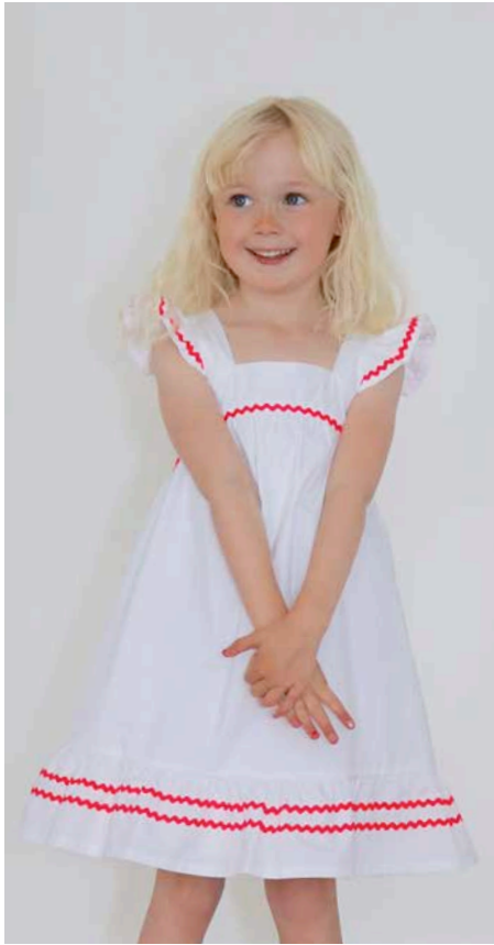
Poppy Dress Cotton Poplin - White