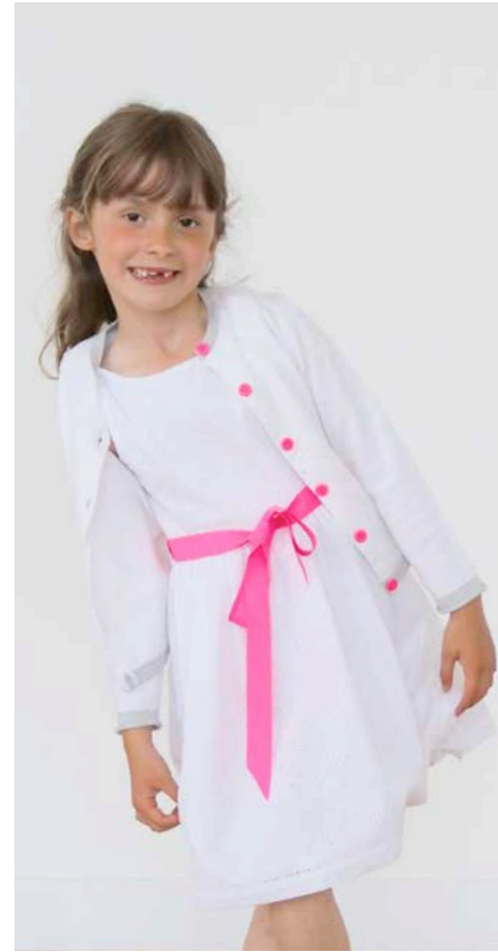
Olive Cardigan Cotton Cashmere - White / Grey