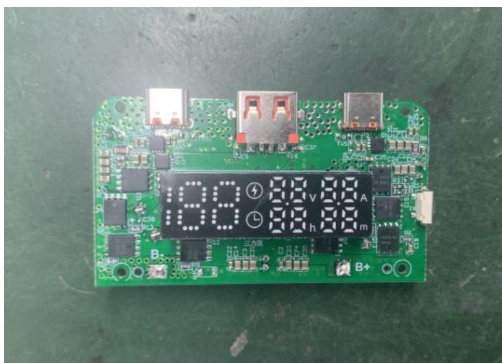
Photo 4 电池组保护板背面 Back view of PCM