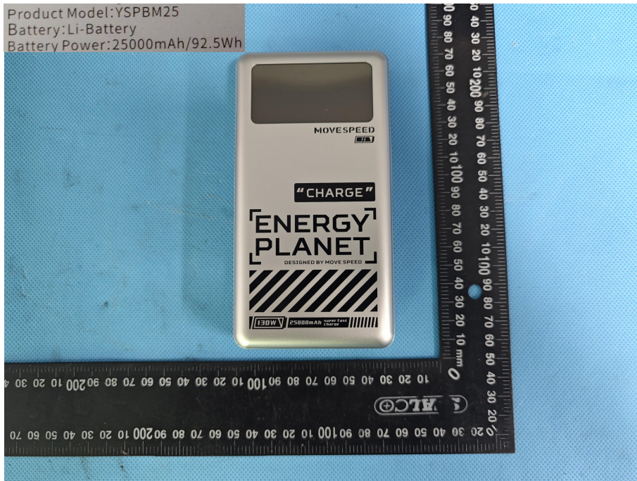
Photo 1 电池组正面 Front view of battery