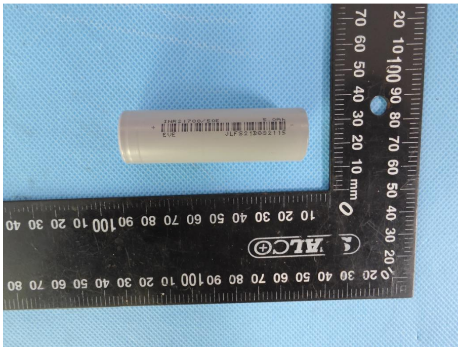
Photo 5 电池正面 Front view of Cell