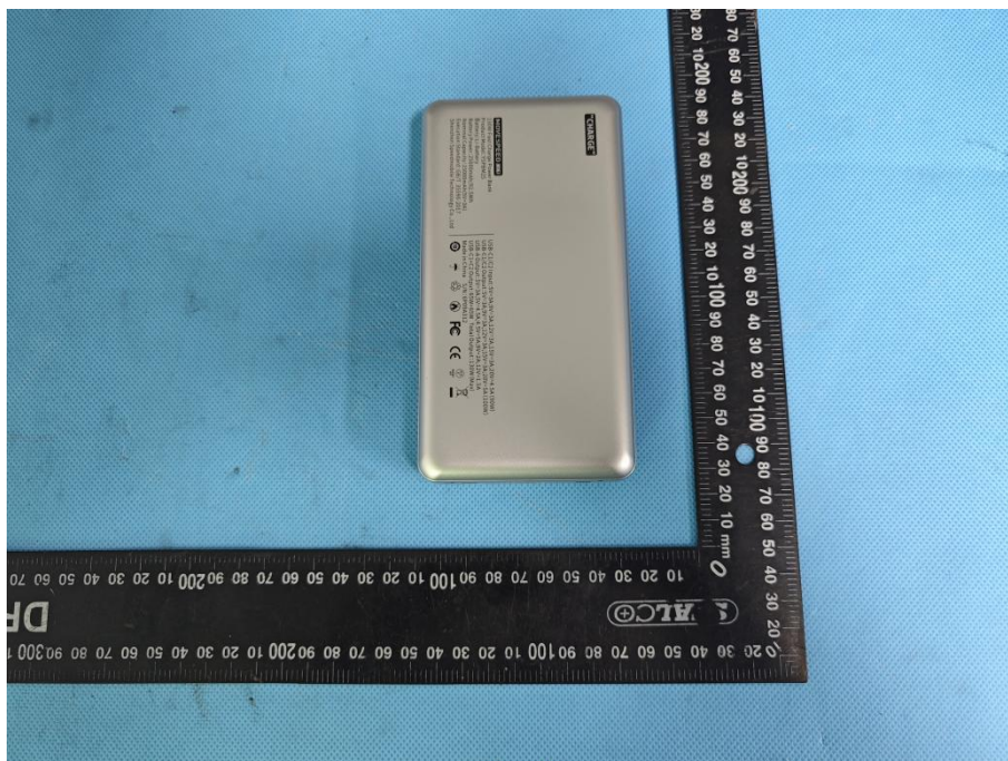
Photo 2 电池组背面 Back view of battery