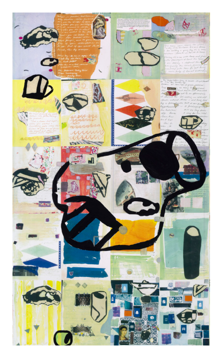
Rock Hard, Mixed media on paper Three parts, each 39" x 23"