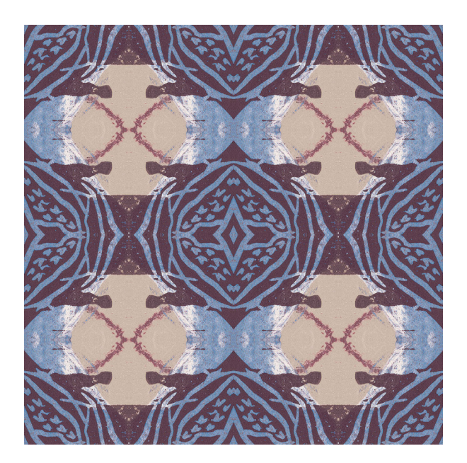
Patterns from the Spirit Suite collection