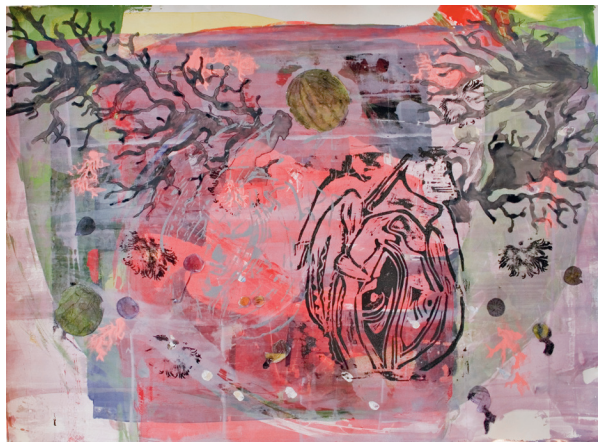
Sea Fruit 1 and 2 — 2009 Silkscreen with gouache and collage 29" x 22"