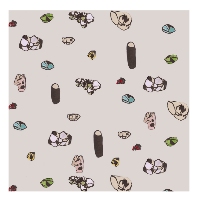
Pattern from the Rock Hard collection

Of late, ensconced in the enterprise of my own (with the profound support of many talented and skilled collaborators) making, I am once again free to articulate a personal narrative. The "Rock Hard" collection, released in 2018, comes from a creative journal of the same title, and reflects this inclination.