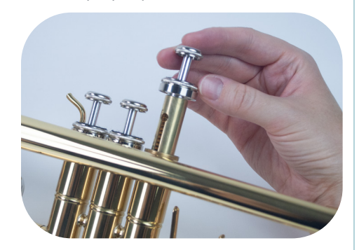
Unscrew the valve cap and gently pull the valve up halfway.

The valves should be oiled every few days. You should oil 1 valve at a time to avoid any accidental damage. Also, each valve is intended for its own valve casing. Although either valve will fit into any casing, they will not allow the trumpet to function properly.