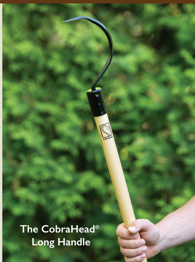
The CobraHead® Long Handle