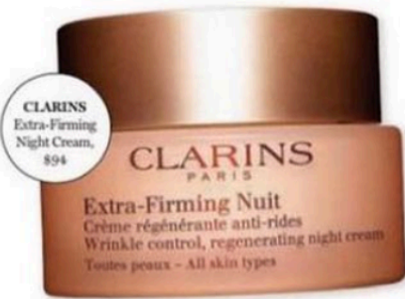
CLARINS Extra-Firming Night Cream, $94