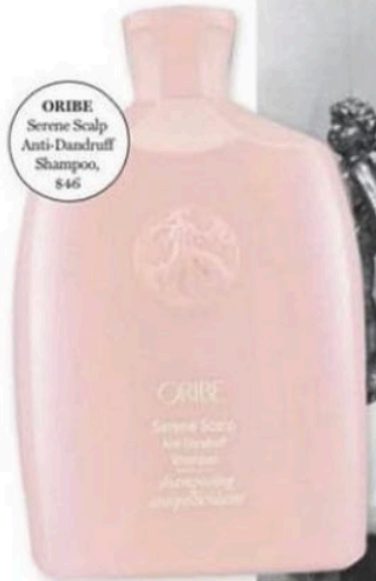
ORIBE Serene Scalp Anti-Dandruff Shampoo, $46