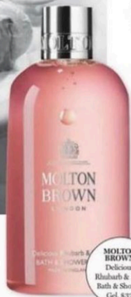
MOLTON BROWN Delicious Rhubarb & Rose Bath & Shower Gel, $32