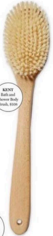
KENT Bath and Shower Body Brush, $108