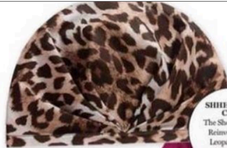
SHHOWER CAP The Shower Cap Reinventd in Leopard and Fuchsia, $43 each