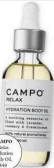
CAMPO Relax Hydration Body Oil, $49