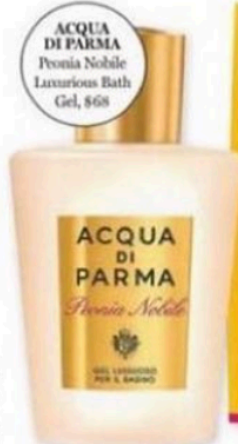
ACQUA DI PARMA Panna Nobile Luxurious Bath Gel, $68