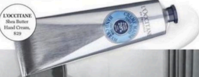
L'OCCITANE Shea Butter Hand Cream, $29