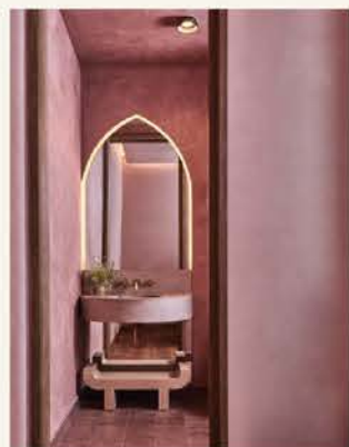
The New York Times