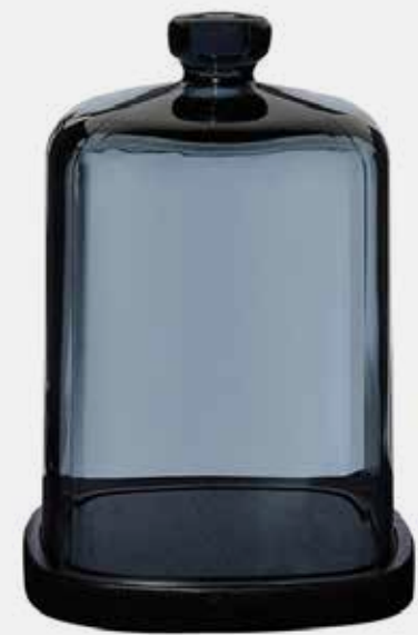
LUMIRA GLASS DOME

The perfect accessory to display your LUMIRA candles and add understated style to your home. This luxurious glass dome is paired with a black wooden base and will not only protect your candles fragrance, but act as a statement piece in your space.