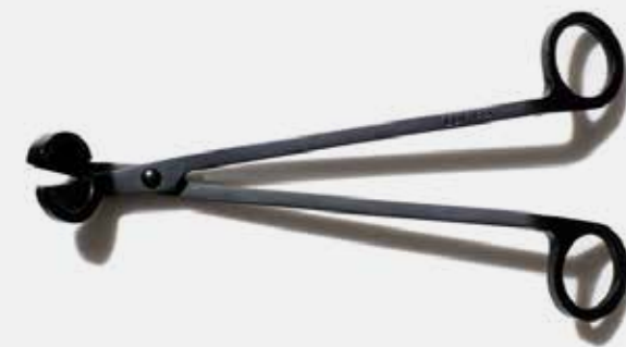
LUMIRA WICK TRIMMER

The perfect accessory to display your LUMIRA candles and add understated style to your home. This luxurious glass dome is paired with a black wooden base and will not only protect your candles fragrance, but act as a statement piece in your space.