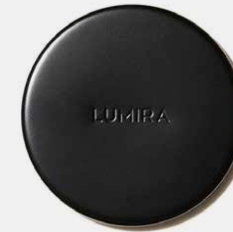
LUMIRA CANDLE LID

Add a sense of luxury to your home with LUMIRA's candle snuffer. The ultimate accessory for extinguishing the flame on your favourite LUMIRA candle.