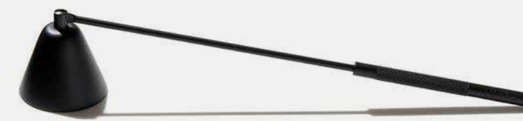
LUMIRA CANDLE SNUFFER

Create a lasting impression with your candle by using the LUMIRA wick trimmer. To ensure a clean burn, this accessory trims your wick to exactly 5mm and will prevent it from becoming too long and/or mushrooming. Clean your wick trimmer with warm soapy water and dry well.