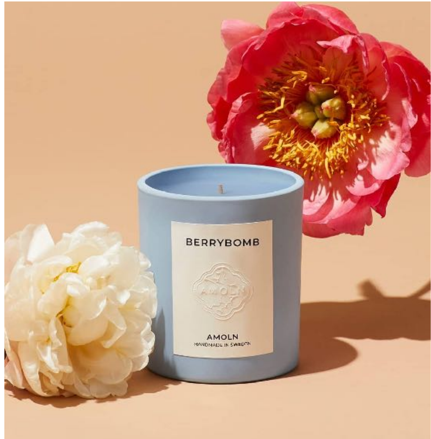
Amoln's subtle yet detailed artwork, packaging and monochromatic candle design are crafted by designers from Copenhagen, Oslo and Bangkok.