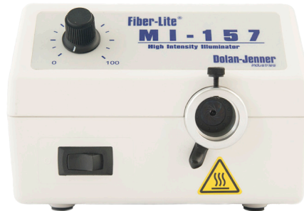
Mi-157 Manual Iris for Precise Color Control