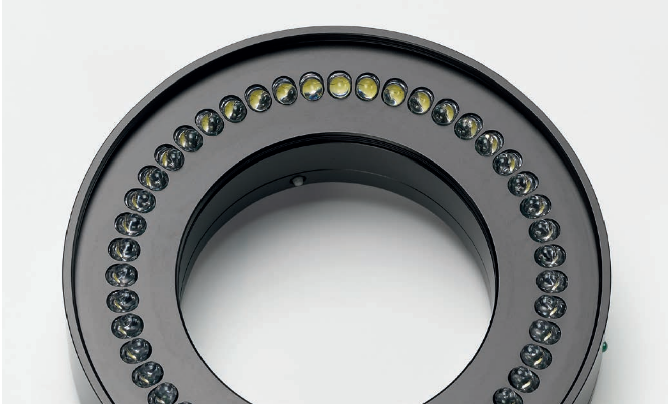
The EasyLED product line integrates advanced LED illumination with control functions in a single compact device. It is the ideal standard illumination system for routine inspections and education.