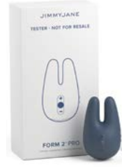
FORM 2 Pro - Slate TESTER