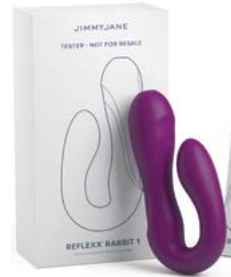
Reflexx Rabbit 1 TESTER