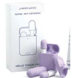
Hello Touch Pro TESTER