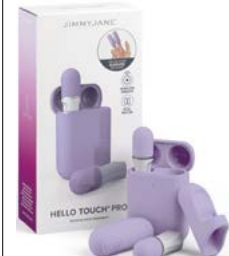
Hello Touch Pro