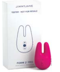
FORM 2 Pro - Pink TESTER