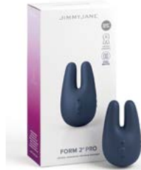
FORM 2 Pro - Slate