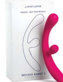
Reflexx Rabbit 3 TESTER