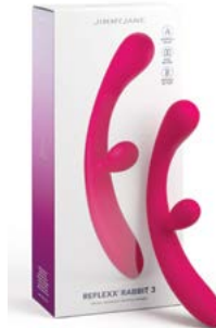
Reflexx Rabbit 3