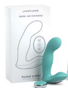
Pulsus G-Spot TESTER