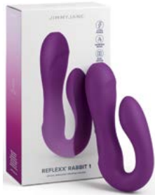
Reflexx Rabbit 1