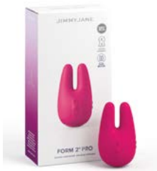
FORM 2 Pro - Pink