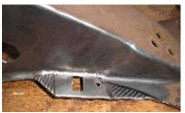
Mark the area to be removed.

(Adjustable stop is included with the CK-167-P kit that comes with a clutch pedal)