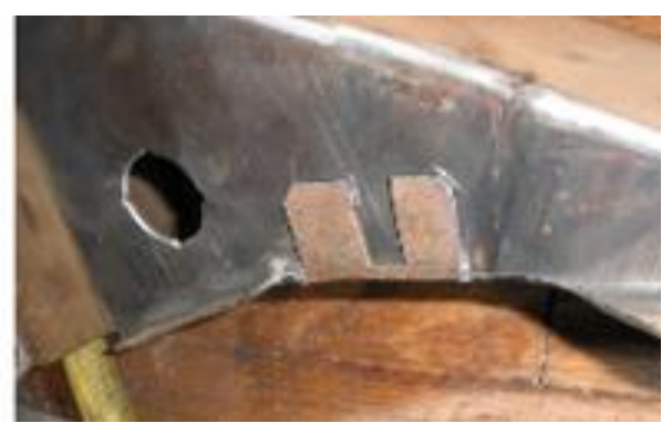
Bend the tab upward. Slot in tab needs to be as low as possible. Once folded, cut out the top of tab.