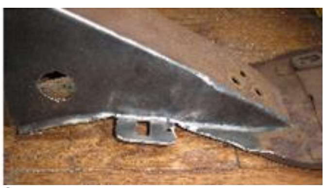
Cut out the marked area. File edges smooth