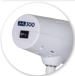
Dual Luminance Settings