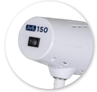
Brilliant, Color-Accurate Illumination

Visit BovieMedical.com for more information